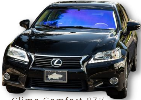
Clima Comfort 83%